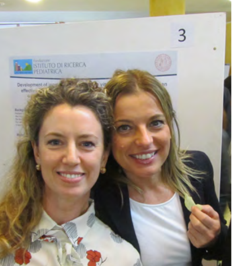
рт. вютеаная sciences University of Padua

ondrial calcium uniporter: dentity and physiological role